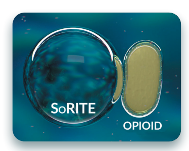
SoRite DECON encapsulates the opioid. SoRite contains the active ingredient Sodium Chlorite.

Our proprietary and patented formula, highlighted by Sodium Chlorite, oxidizes and destroys fentanyl and heroin. A number of chemical groups in fentanyl and heroin, especially the carbon linked oxygens and nitrogens, are highly susceptible to oxidation which cleaves and destroys fentanyl and heroin at those locations.