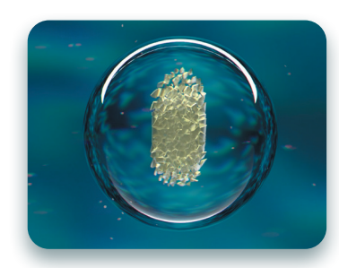
The opioid is destroyed.